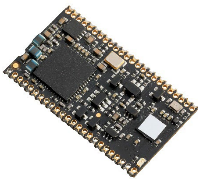
C0 version (SMT mounting)

Miniature RFID module (LF/HF/NFC) for external 50 Ohm antenna