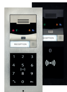
2N® IP Verso and 2N® LTE Verso

In 2016, 2N was acquired by Axis Communications AB, the number one company in the network video market. This has opened the door to long-term development for 2N and has increased their requirements for reading performance and number of supported transponders. Due to these new challenges, 2N decided to upgrade their units to the new generation of ELATEC's RFID modules, the TWN4 MultiTech Nano.